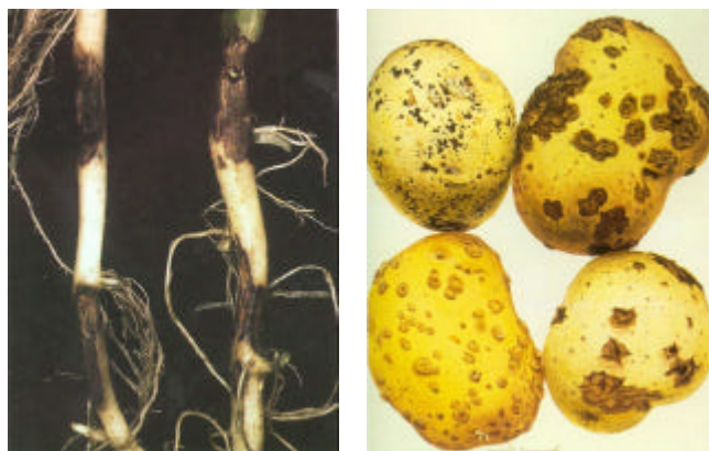
LEFT (PHOTO 1): DRY, BROWN CANKERS DEVELOP ON SHOOTS, STEMS AND ROOTS.

Rhizoctonia diseases often have common names that describe symptoms on particular crops. On potato tubers it is commonly known as 'Black Scurf'. Symptoms appear as dry, brown cankers (Photograph 1) which develop on shoots, stems and roots. Leaves near the tops of shoots may become bunched, curl upwards and turn yellow or purple. White powdery growth covers stems just above ground level. Developing tubers may become cracked and pitted. Small dark fungal resting bodies that resemble specks of dirt form on tuber surfaces (Photograph 2) which can not be removed easily by washing.