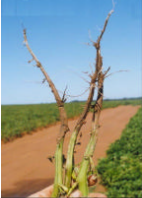
PHOTO 7. LITTLE ROOT SYSTEM, NO SPUDS DEVELOPED 6 WEEKS BEFORE HARVEST

Damage to sprouts, stems and stolons are evident in this paddock. Furthermore, root development (feeder roots) is almost non-existent. A minimal number of spuds had formed throughout this paddock 6 weeks before harvest. Photograph 7 (below) illustrates the condition the root system was in.